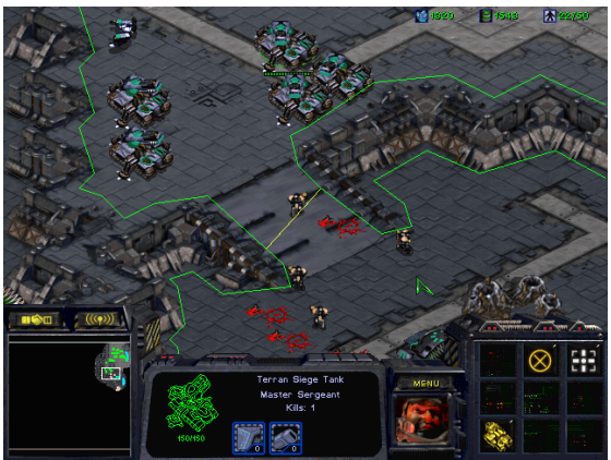
Figure 4. Feign attack to front of the base

MIDCA could infer. While some automated bots already exhibit this behavior in specific situations, it is not an explicit concept. The agent will be able to carry out more sophisticated attacks if the notion of defense is explicit and flexible, because one could imagine not only