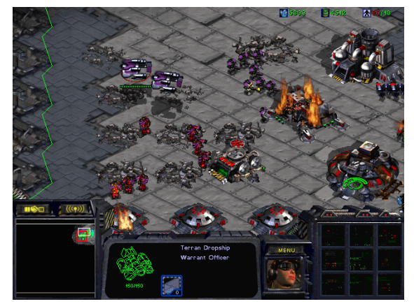
Figure 3. Assault from behind the enemy's base

While attaining automated players for RTS games that can play at the human level are an interesting challenge in their own right, they also can be seen as a challenge for agents that can exhibit high-level cognition. The latter is one of our main motivations with this