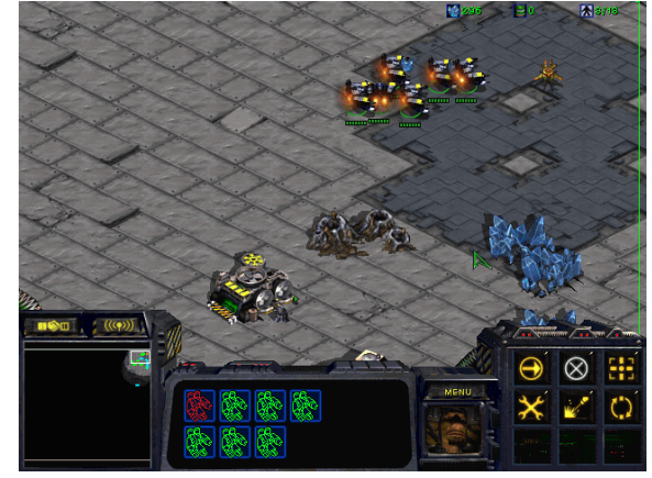
Figure 2. The workers following an enemy's probe

Using the concept of distract, MIDCA could perform strategies at a higher level, such as distracting the enemy with a small force of units at the front of their base and concurrently sending units via dropships behind the enemy base. In Figure 3, air ships have entered the back of the base from the left side and have