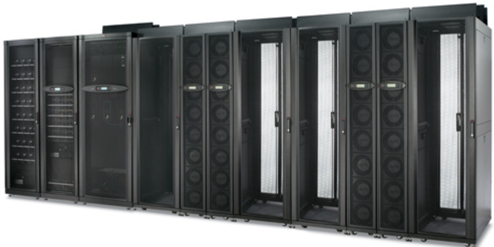
APCC integrated power, cooling, management