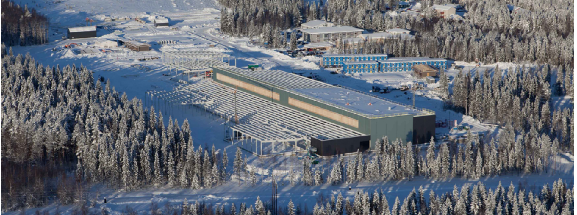
Facebook data center in Sweden.